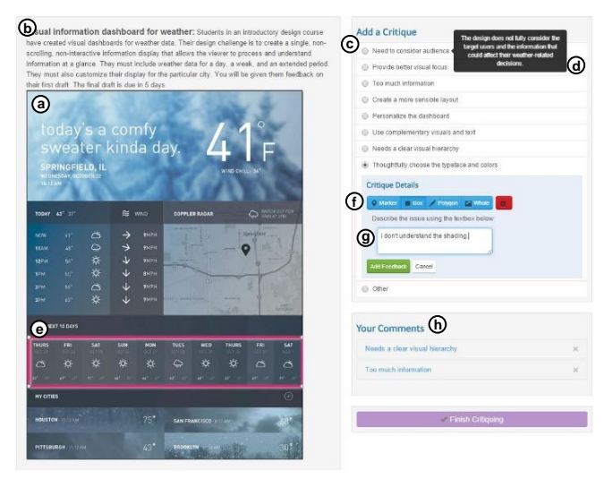
Figure 1. The feedback interface with rubric provided. See Apparatus for a description of the components.